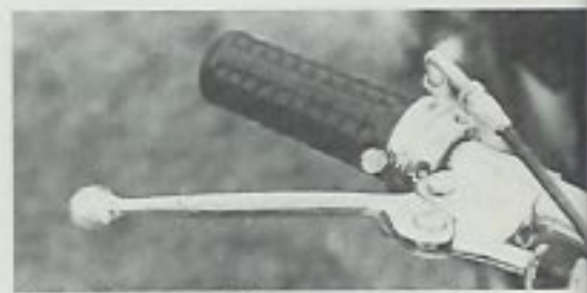
Control levers stick out at an awkward angle and are hard to use.

The weak point of the engine is said to be the rings. Serious racers