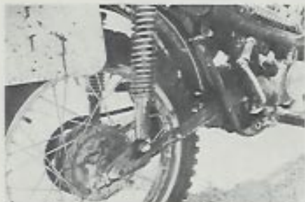
Rear shocks were nothing fantastic, but did an adequate job.

use it for stirring paint or something like that.