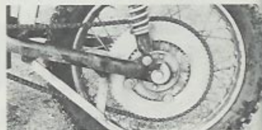
Rear sprocket is overlay type held on with four bolts.