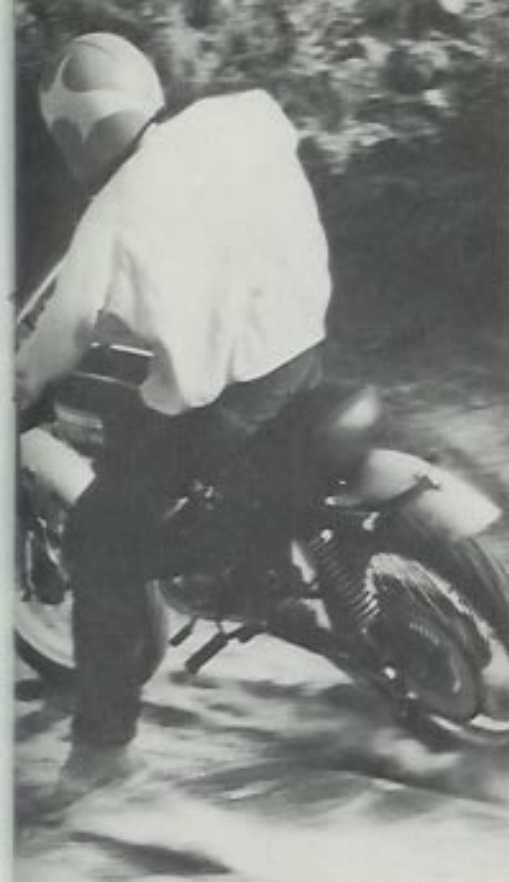
Baja is very tall, making sliding difficult for short riders.

replace the standard items with Webcos, but we experienced no problem with our test bike at any time during the test session.