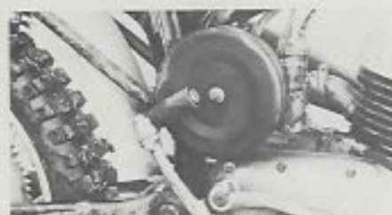
Air cleaner, not shielded from direct dirt blast, needs re-designing.

The Baja comes standard with a Filtron air filter, which is a definite plus. It would be even better mounted in a still air box.