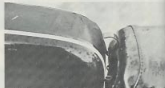
Metal loop at front of seat could cause serious hangup.