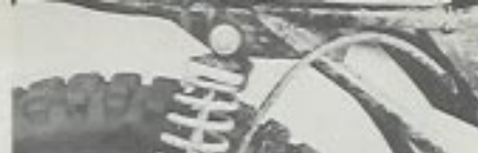
Frame is well gusseted, and no flex is detected at any time.

The question remains: Is the rider willing to go through all that work just to ride a Harley?