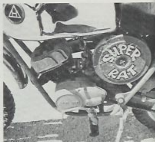
Hodaka engine is light and compact. Air cleaner is inadequate.

engine would scream its guts out instead of dying.