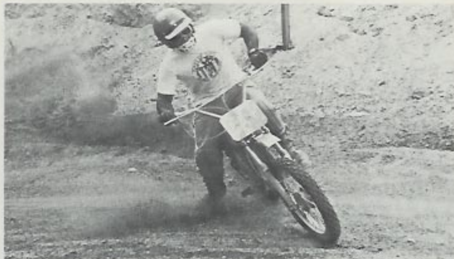
Super Rat was an easy slider as long as power was kept on.