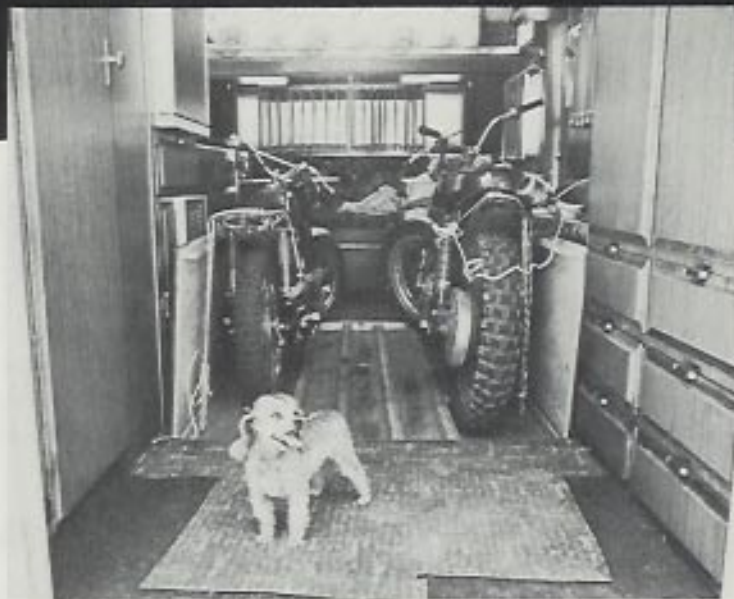
Journeyman Trailers delivered the Baja to our test site in one of their new units. As you can see, it has room for three bikes and at least one foo-foo dog.