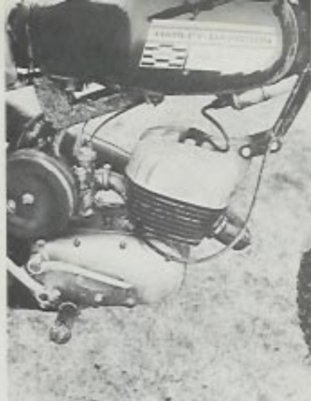
Engine location is high, offers no protection to vitals.

The front fender is of the low-mounted variety, but the rear edge is much too close to the tire. A wayward rock or stick could jam the wheel.