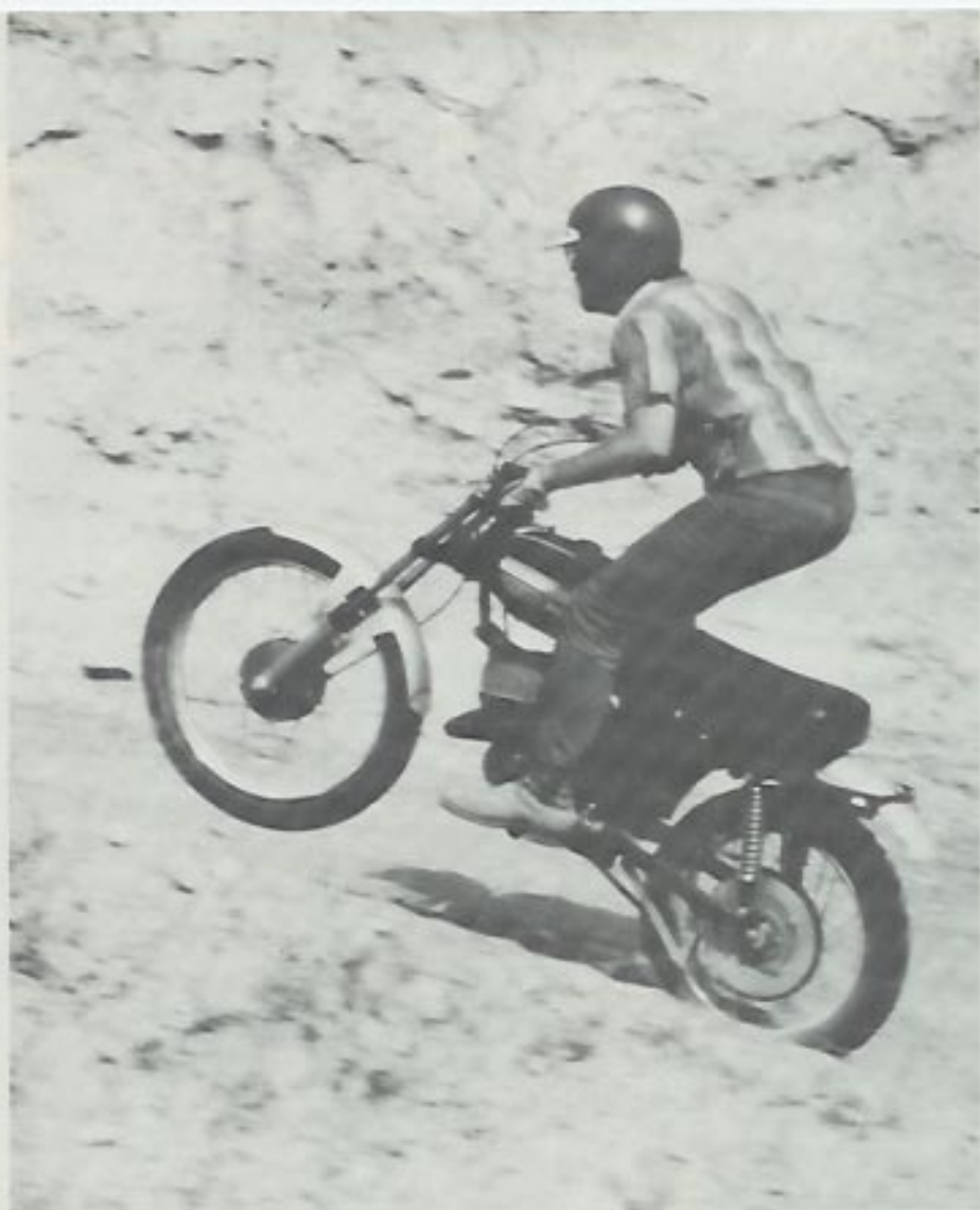
Baja is light, and front end can be lofted with body weight shift.

clearance adds to the high center of gravity. This translates into unsure handling when the machine is cornered. Leaning the Baja over, riders get the feeling they are on the end of a long stick that will surely fall.